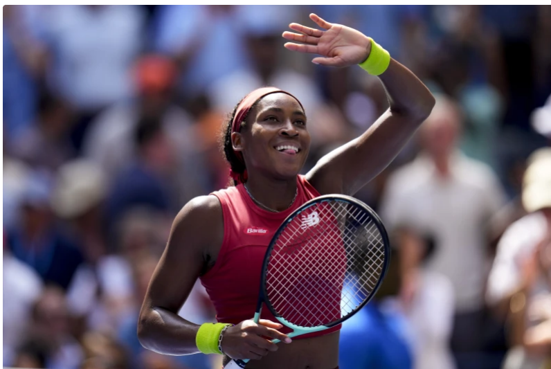
Coco Gauff reaches her first US Open semifinal at age 19 by beating Jelena Ostapenko 6-0, 6-2