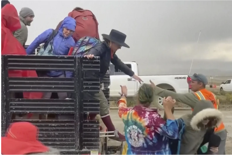
Wait times to exit Burning Man drop after flooding left tens of thousands stranded in Nevada desert ▶